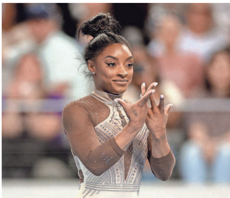
Simone Biles won her ninth U.S. title, extending her own record. But her most memorable moment Sunday had nothing to do with competing and everything to do with her competition.