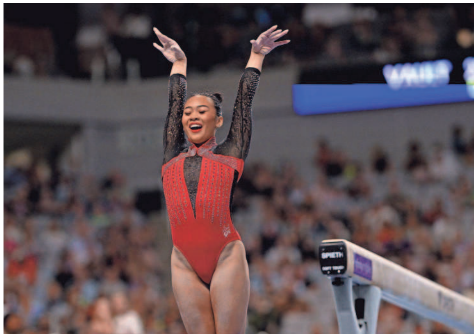
Suni Lee had top-four finishes on her two signature events, uneven bars and balance beam, on Sunday.

tunnel in a corner of Dickies Arena, practicing handstands in privacy while trying to regain her composure. Encouraging words from Simone Biles helped, she said. In an unusual move, Biles sought Lee out to comfort her and stayed near the uneven bars during her next routine, cheering "You got this!" as Lee grasped the bar. "It was really nice having her in my corner," Lee said.