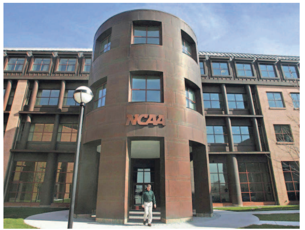
NCAA headquarters in Indianapolis.